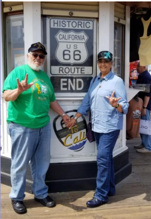
...at the end of Route 66, Santa Monica, CA