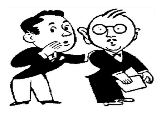
I HAVE HEARD A RUMOR