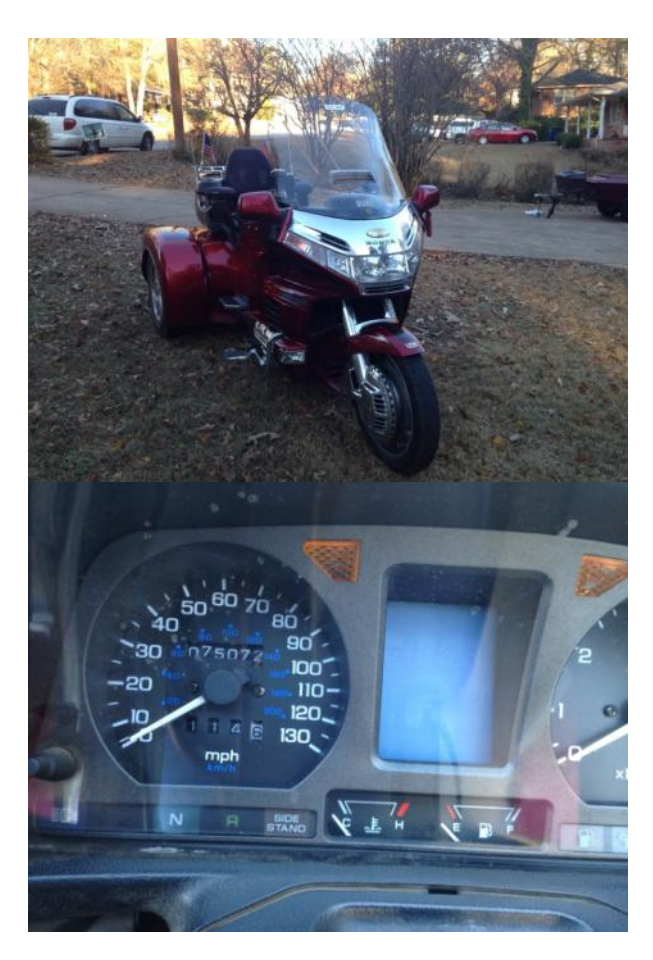
Continued Next Page