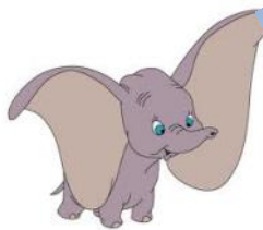
Your Friend, Dumbo