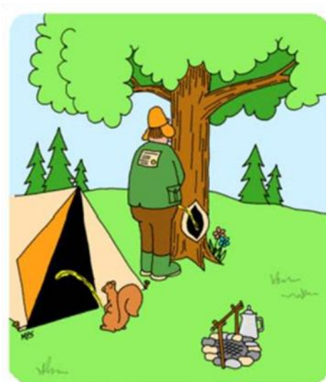
The Balance of Nature

A Little bit of humor to lighten your day!!