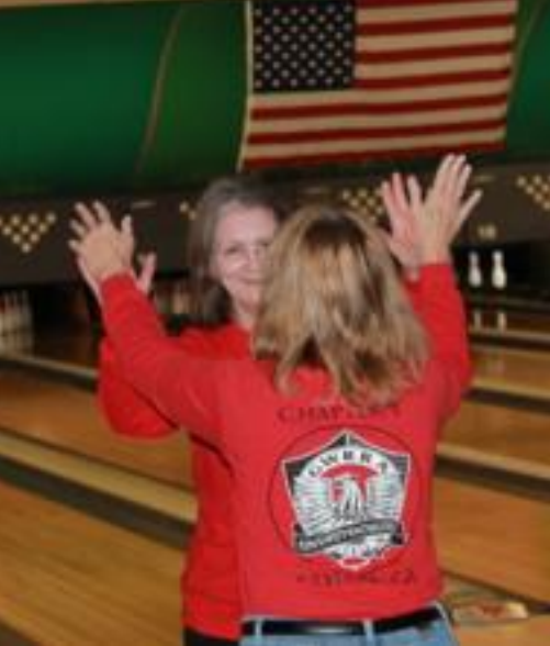
FRIENDS for FUN SAFETY and KNOWLEDGE